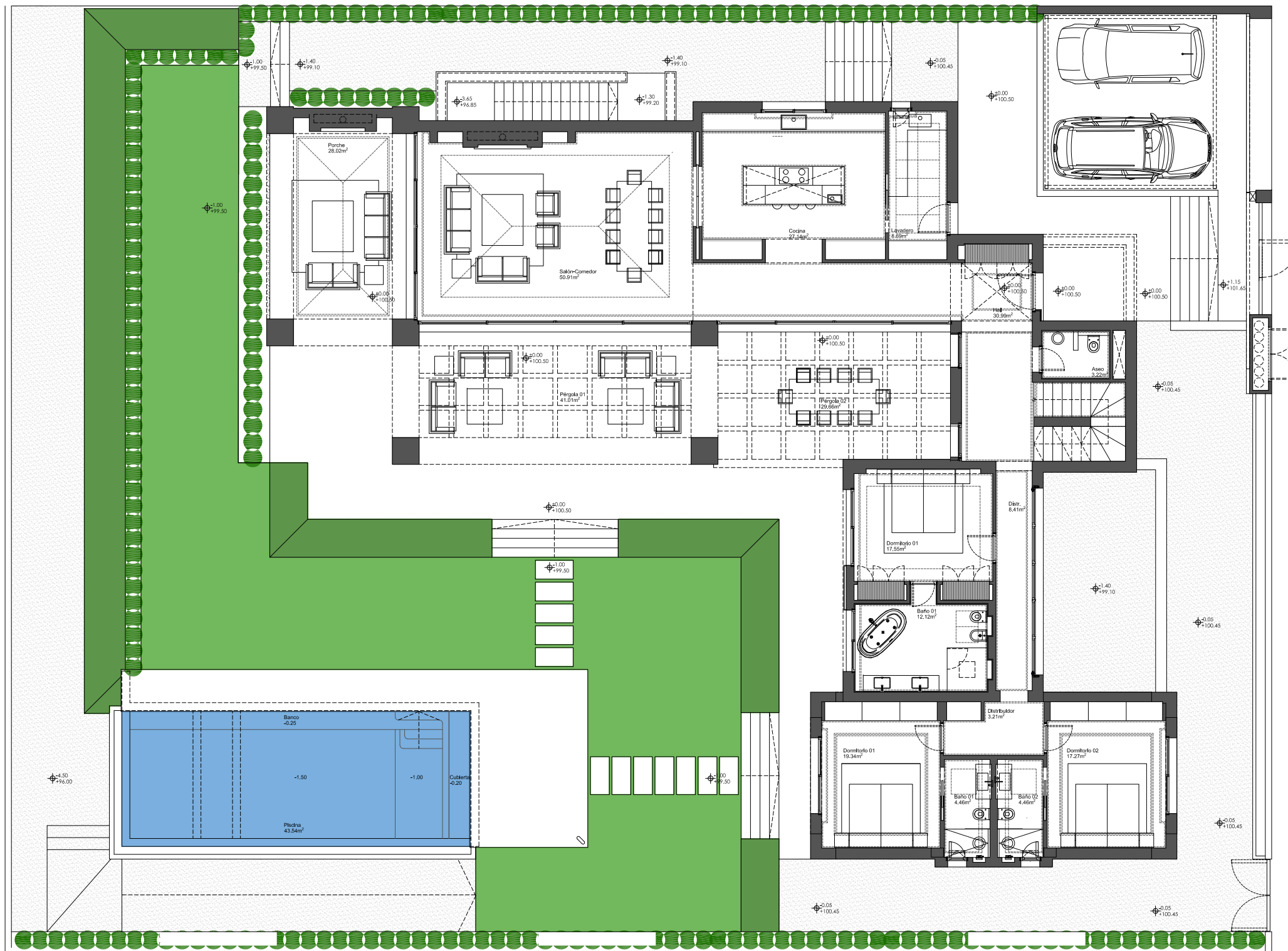
GENERAL LAYOUT · 1/150 · A3