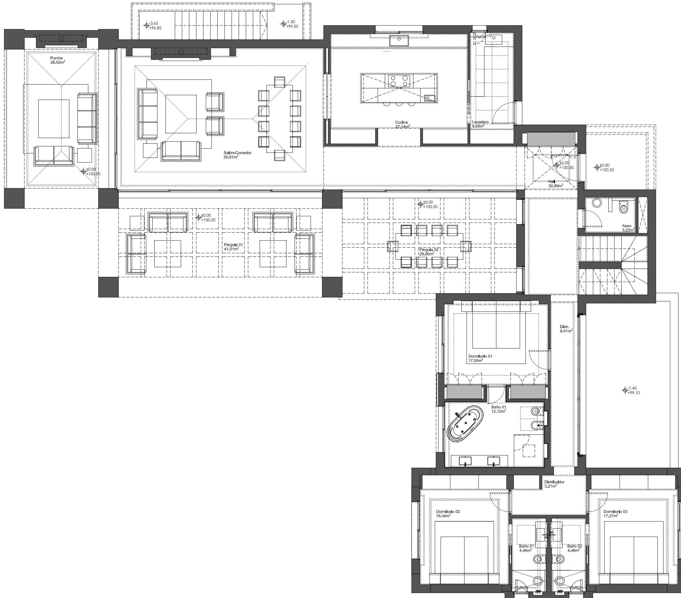
GROUND FLOOR · 1/100 · A3